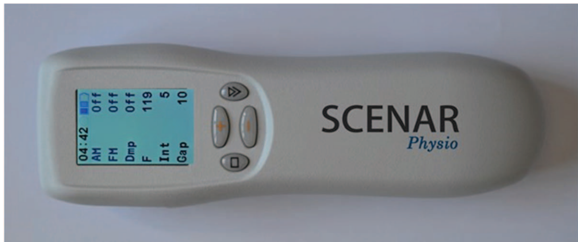
Figure 1. NAE device.

group underwent the same procedure for readings of conductivity skin reaction (time-impedance-type values) and the therapy stimulation phase with the sham device. Treatments were always carried out at the same times by a therapist with experience in handling the SCENAR device (Transdermal Electrostimulator SCENAR class IIa, CE-2265 Operating Manual. Version 7.2–02, May 2018).